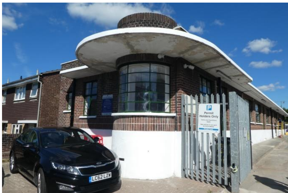
The front of the Office wing from London Road

hoped that one wall can be used to display photos of people who worked in the depot, so please make contact if you have any. It is worth having a closer look at the building when you next pass.