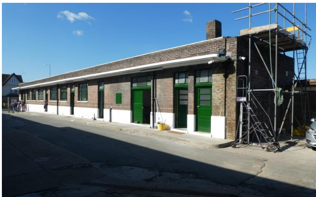
The Office Wing from the far end looking towards London Road, 17 September 2022