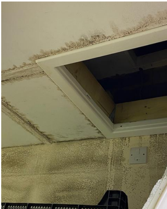
Mould already developing on ceiling and wall at the Centre, 4 January 2023.

The Society is often involved in wider community affairs such as various village events in Eynsford and in Farningham. We were invited to join re-appraisal walkabouts round the Conservation Areas for Eynsford and for Farningham with Sevenoaks District Council conservation officers and consultants in the autumn. We were able to make suggestions on what changes might be made and what should remain unaltered, and felt that our local knowledge was appreciated. FELHS also provided the bulk of the material used in the displays in Eynsford Station waiting room, under the aegis of the Darent Valley Community Rail Partnership.