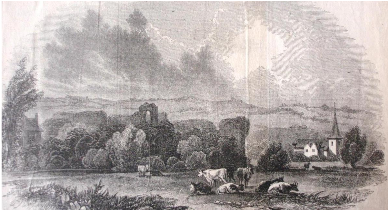
Eynsford Castle and Church - a print found in a scrapbook of Eynsford in the Kent Archaeological Society library - date unknown, but seems to be before the collapse of the castle wall.