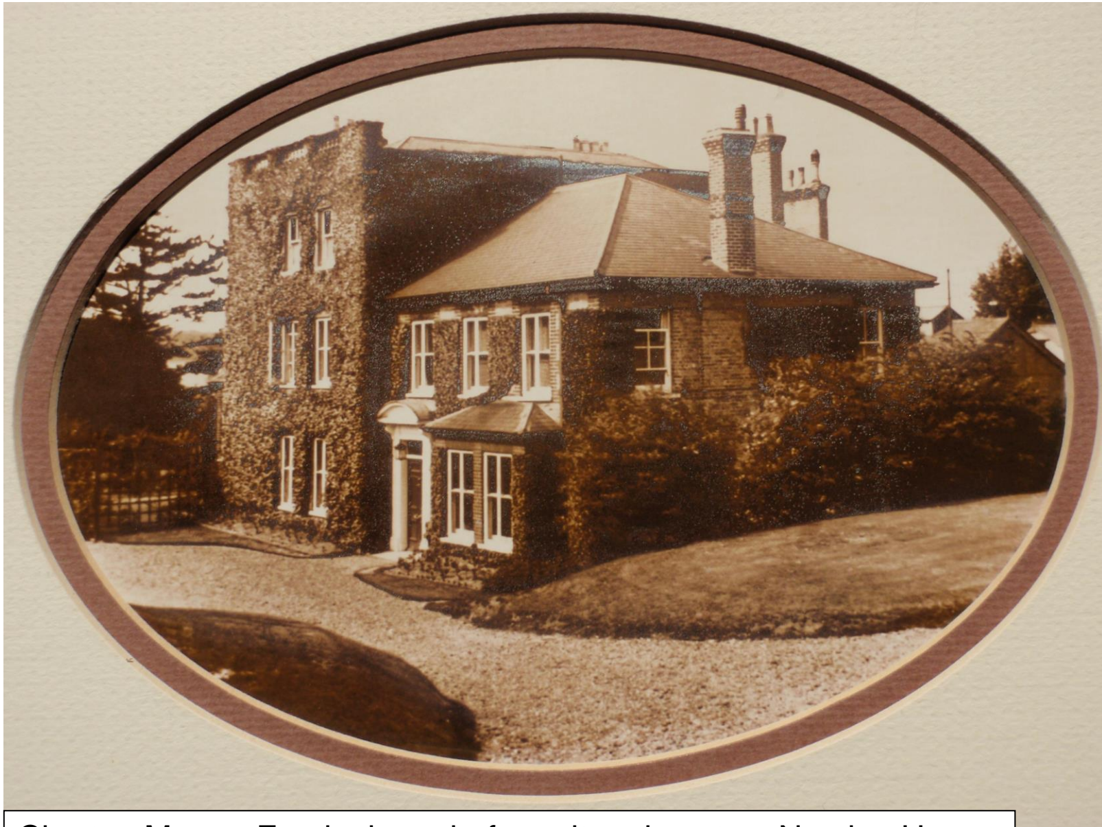
Charton Manor, Farningham, before alterations to a Nursing Home