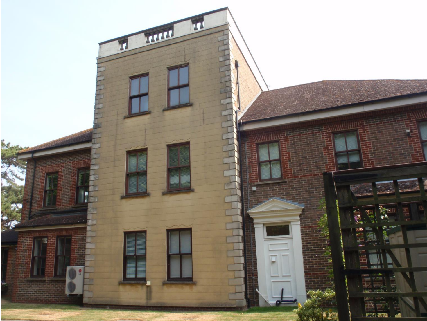
South face of Charton Manor, now Nursing Home, little of original manor house left, July 2013